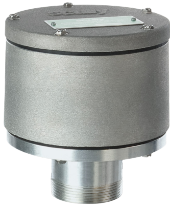
SP-H Holder (for 1–3 sensors)

Featuring Dynacheck® – Automatic and Continuous Self-Checking Circuitry