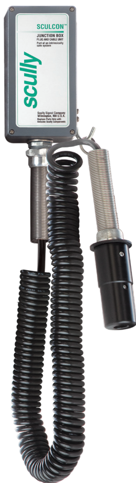
Sculcon Junction Box with Ground Plug & Cable

The control monitor connects to a heavy duty Sculcon® junction box with attached cable and special quick release snap-on plug. The Scully Ground Plug connects to a specially designed electronic Scully Ground Ball mounted on each vehicle. The controller in conjunction with the ground ball provides and verifies vehicle grounding before loading can begin. The controller must receive an electronic return signal from the ground ball throughout the loading operation.